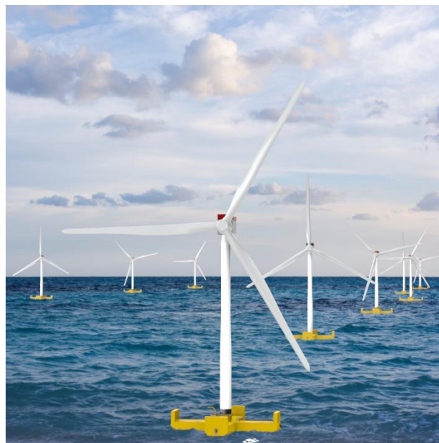
Figure 2: VoltornUS+ Hull Technology

University of Maine has been developing concrete floating foundation technology for floating wind since 2008, has received over 70 patents, and has been working on industrialization approaches with many leading concrete contractors for the US and European markets.